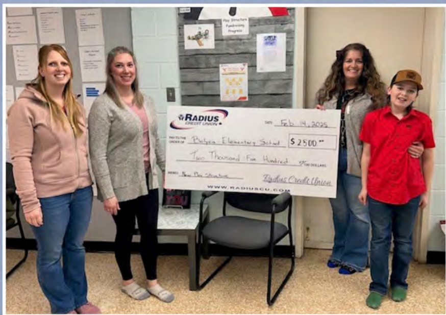
BULYEA PLAYGROUND DONATION