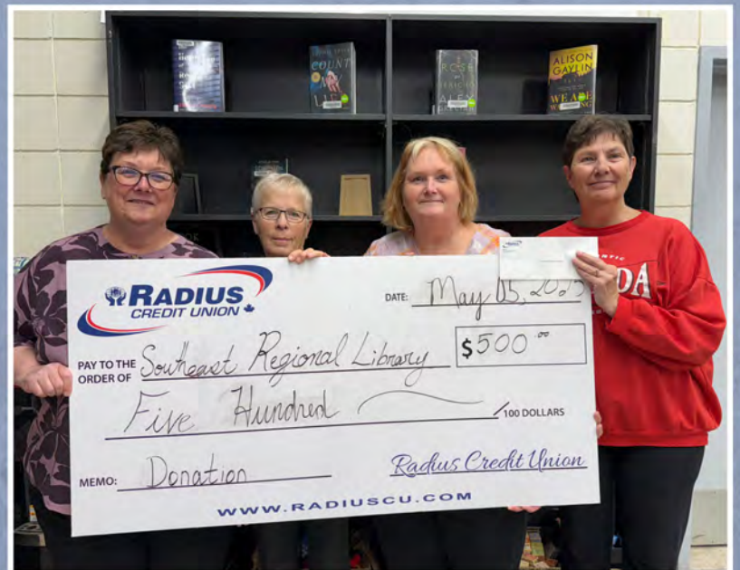
OUNGRE LIBRARY DONATION