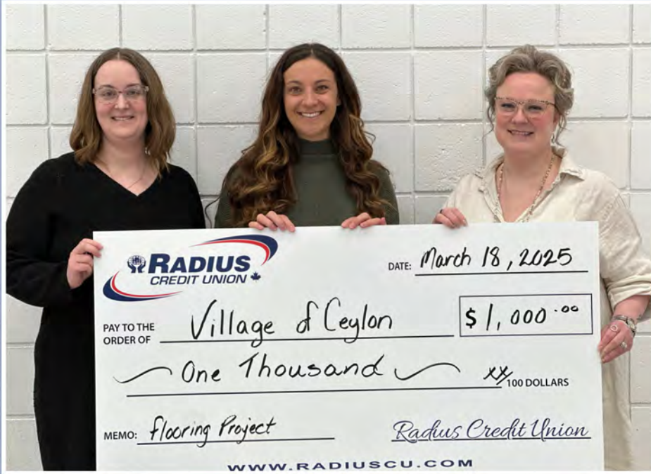
VILLAGE OF CEYLON - PRAIRIE PRIDE COMMUNITY CENTRE FLOORING PROJECT DONATION