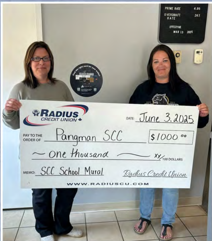
PANGMAN SCC MURAL DONATION